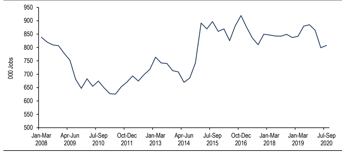
Exhibit 1: South Africa's agriculture employment