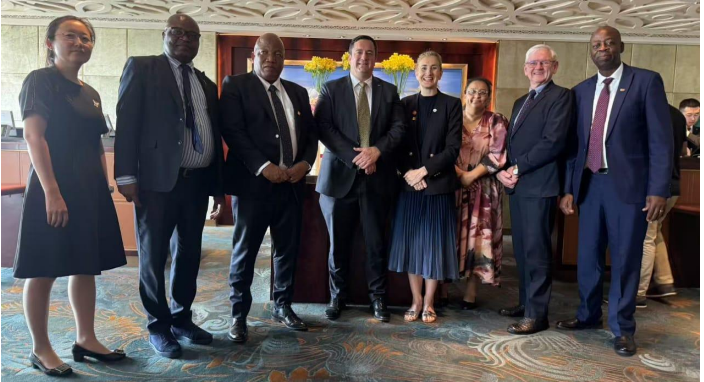
Delegation with Minister Steenhuisen

Meanwhile, on the other side of the world, urgent attention is needed to address the trade situation with the United States . The proposed 30% tariffs on South African exports are a serious threat to our competitiveness in that market. We remain hopeful that clarity will be provided in the coming weeks ahead of the implementation deadline on 1 August .