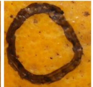
Healthy spot on healthy sample (CBS-negative)

Port of Cape Town: The FruitSA shipping meeting has taken place providing necessary action items to execute during the deciduous and throughout the citrus season. Additionally, the FPEF and PPECB will participate in discussion and also onboarding cold stores wishing to make use of 24-hour inspections. This will improve nighttime reefer container exporters alleviating much needed pressure from the port. Inland container depot facilities remain a top priority in the short and medium term. Increasing the number of facilities and improving utilisation of existing facilities (e.g., Belcon), could make a significant difference while deciduous fruit export volumes will rapidly increase from week 5 and onwards. In conjunction with Belcon, rail opportunities between Belcon, Cape Town and Port Elizabeth should be prioritised by TFR. Industry will revisit these options in the near future.