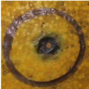
Advanced stage (CBS-positive)