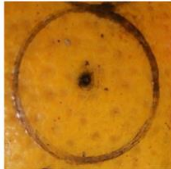
Early stage (CBS-positive)